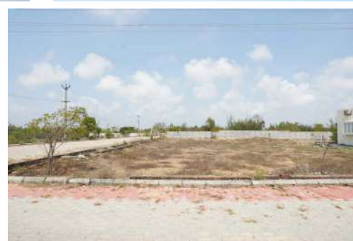
Actual site images