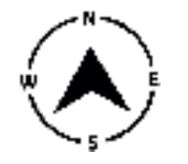
BASEMENT FLOOR MASTER PLAN