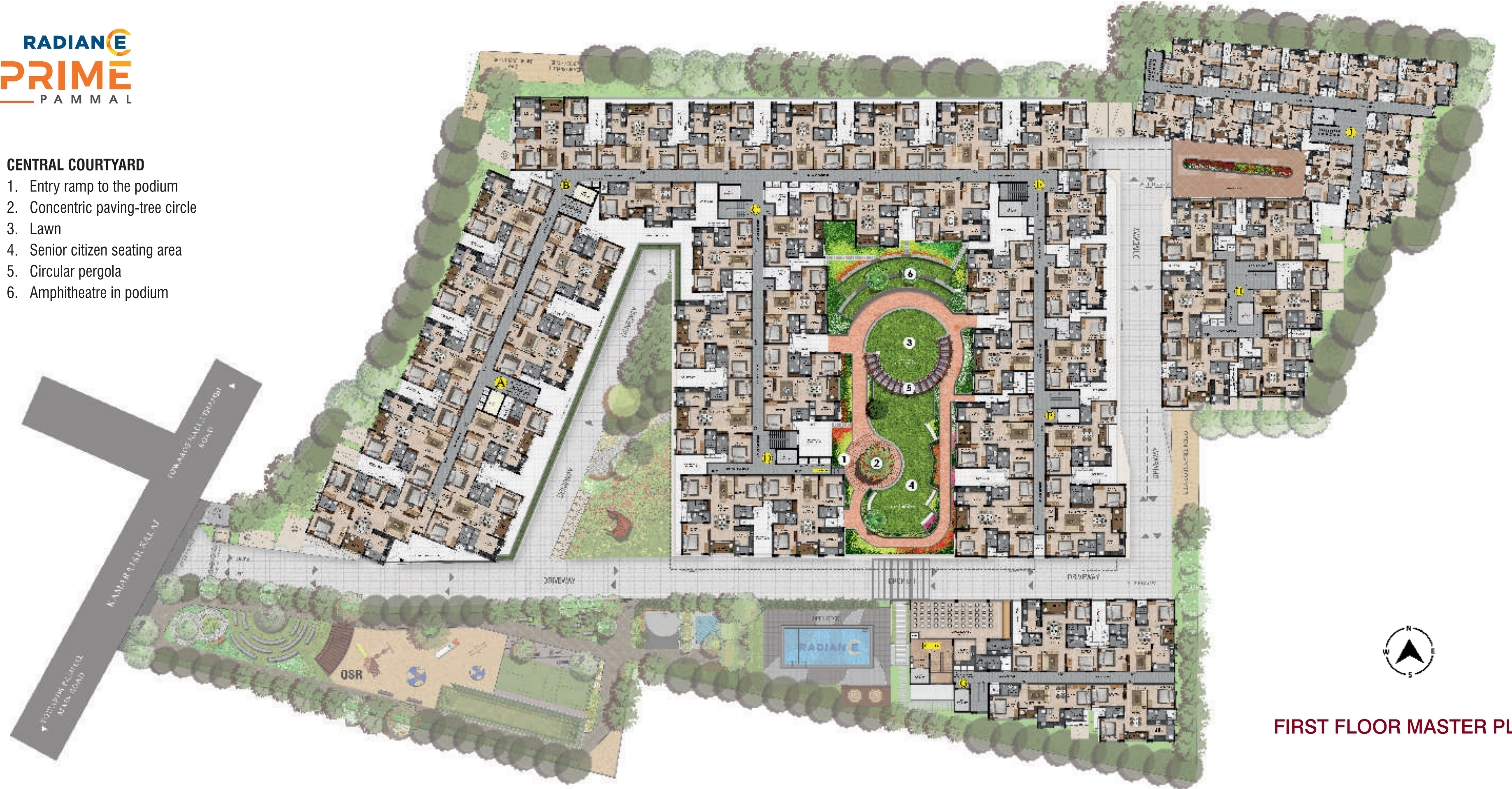
FIRST FLOOR MASTER PLAN