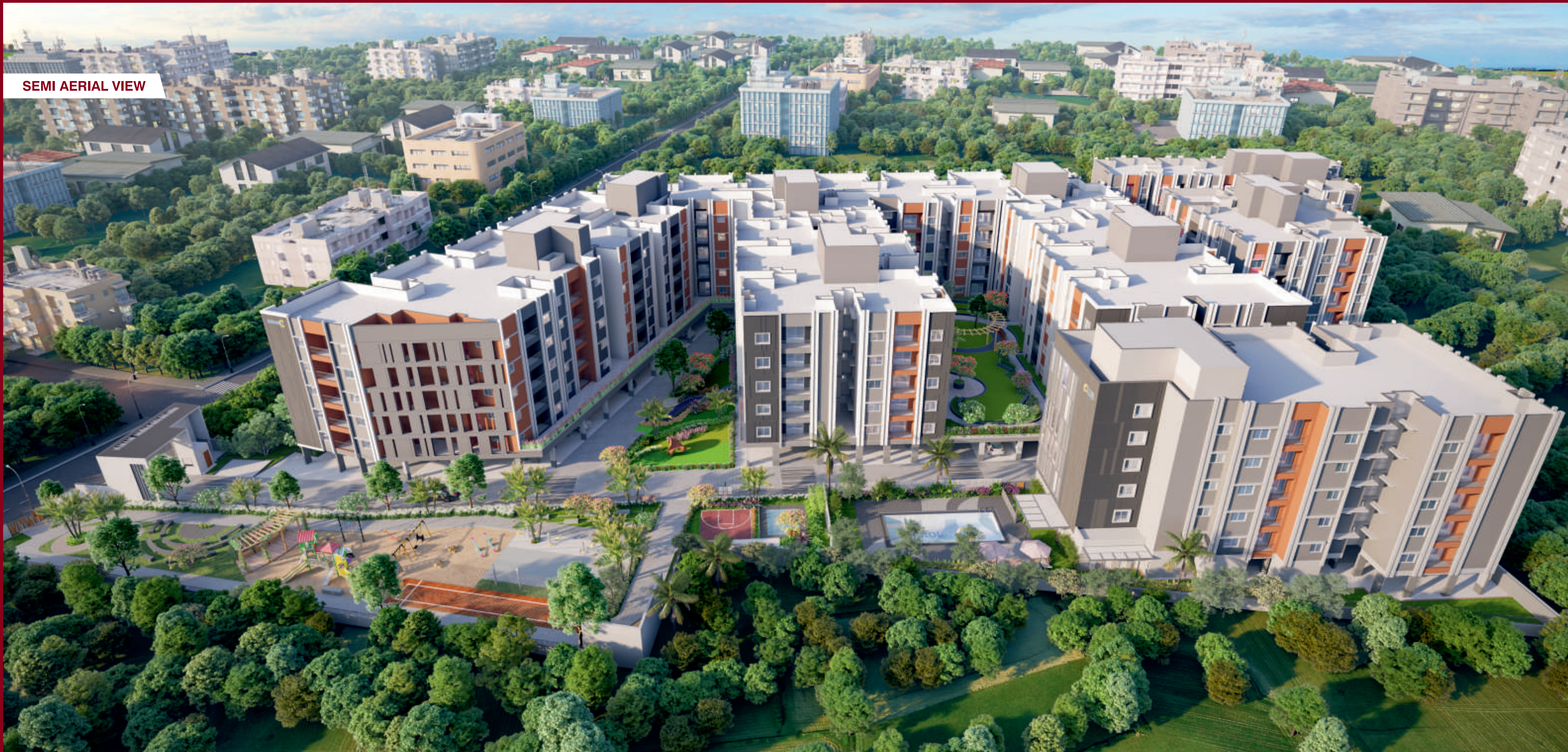
SEMI AERIAL VIEW