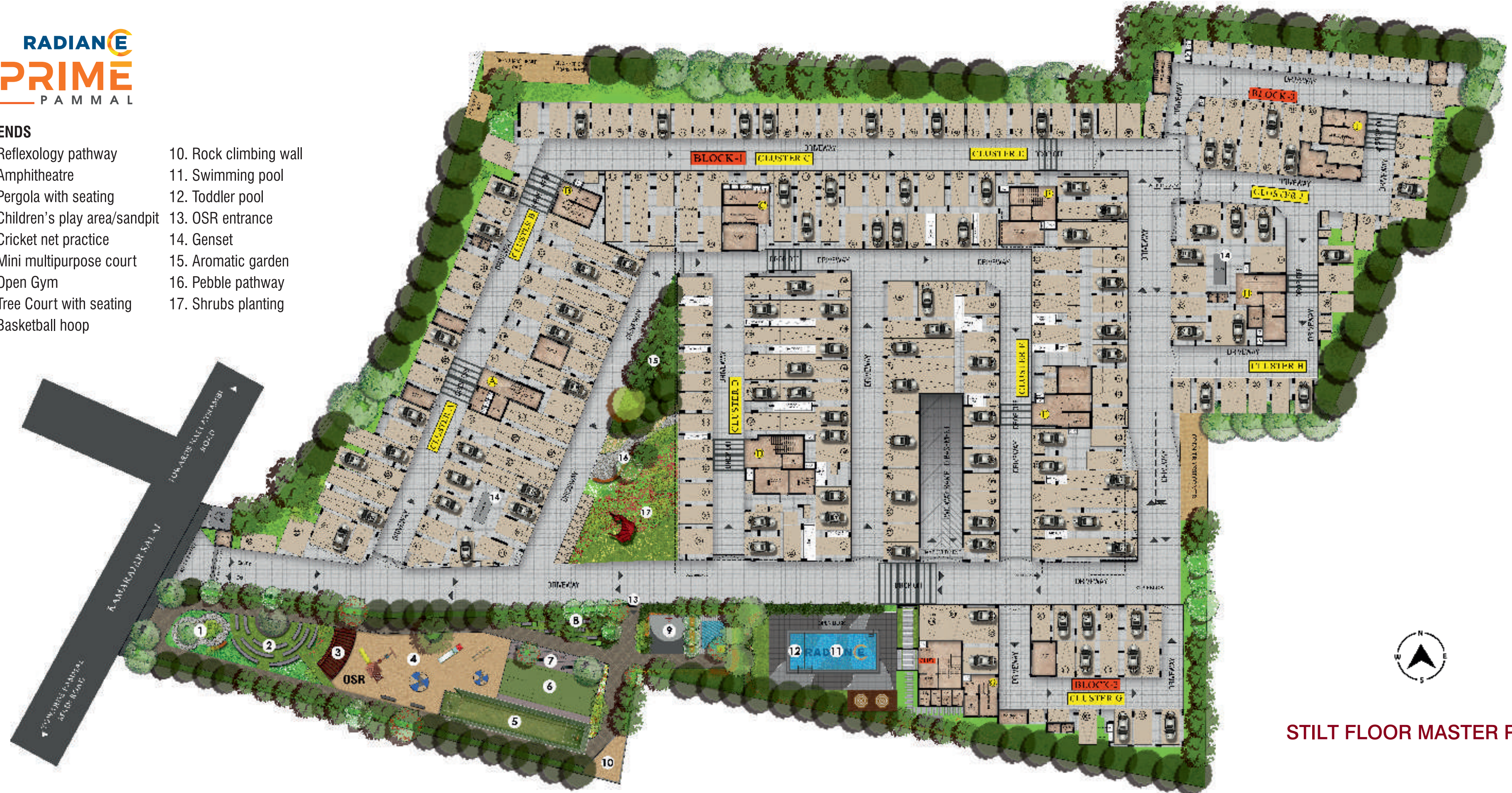
STILT FLOOR MASTER PLAN